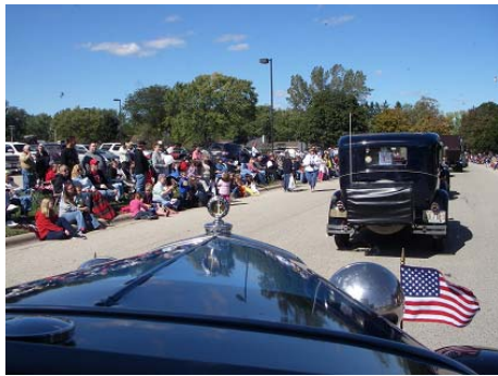
Big crowds come out for the Stillman Valley parade