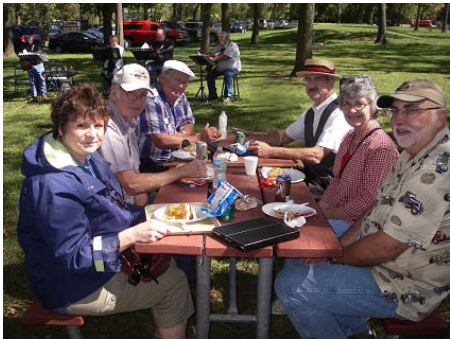
Friends enjoy a picnic lunch at Beckman Mill near Beloit, Wisc.