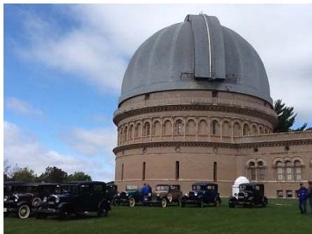
Rock-Ford A's joined the Great Lakes A's at Yerkes Observatory in Williams Bay, Wisc.