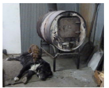
My trusty dogs lying by the hot wood stove. The Weiner dog uses the big dog as a heat pad.

Will keep you posted on progress . Mike Peters