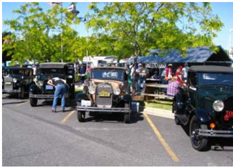
It's all about those great cars!