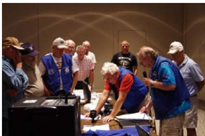
NU-REX timing wrench demonstration

This actually can be a one-man job, if necessary!