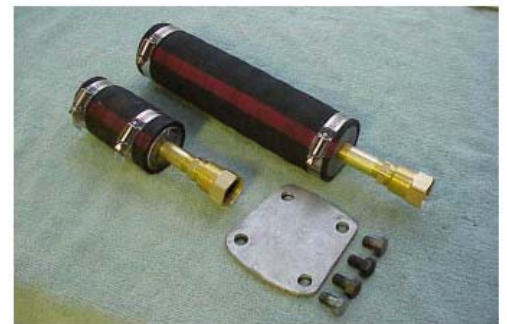
Shown above are the two adapters and the water pump blanking plate. The long hose is the upper (larger diameter) hose. The short hose is the lower (smaller diameter) hose.

You can also start the engine up to add some vibration if desired. The hot water will not only aid in flushing the engine, it will also prevent the possibility of cracking the block with the use of cold water if you run the engine.