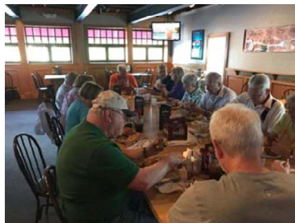
Members enjoy a monthly dinner – this time at the Firehouse Restaurant in Roscoe, Illinois