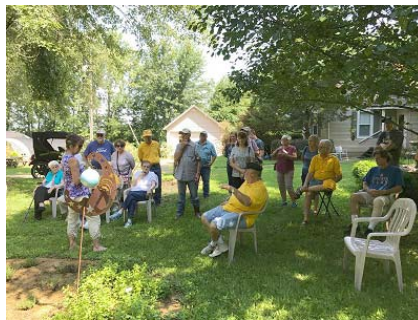
Members from the Rock-Ford A's and local Model T clubs enjoyed a tour to the Wind Ridge Herb Farm in Caledonia, Illinois