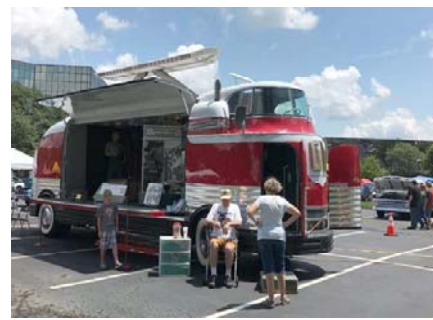
Some members travelled to the Arthritis Foundation Car Show in Dublin, Ohio