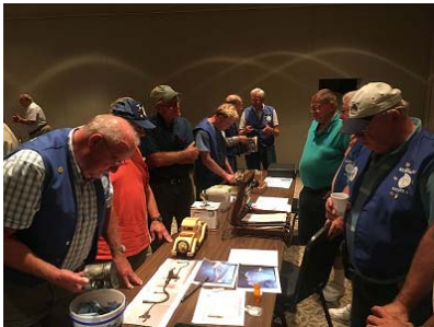
Miscellaneous car troubles, repairs and stories