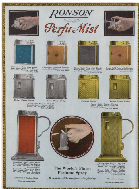
L & C Meyers Company, 1930

These perfume sprayers resembled cigarette lighters but were totally different. Ronson and Evans Company both produced these misters. Also notice the two different sizes of the Ronson Perfu-Mist in the following advertisement.