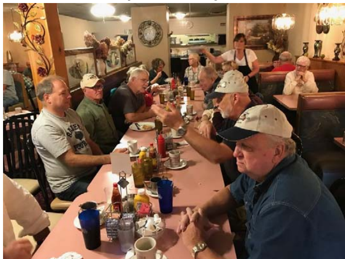
October 7 Breakfast Club