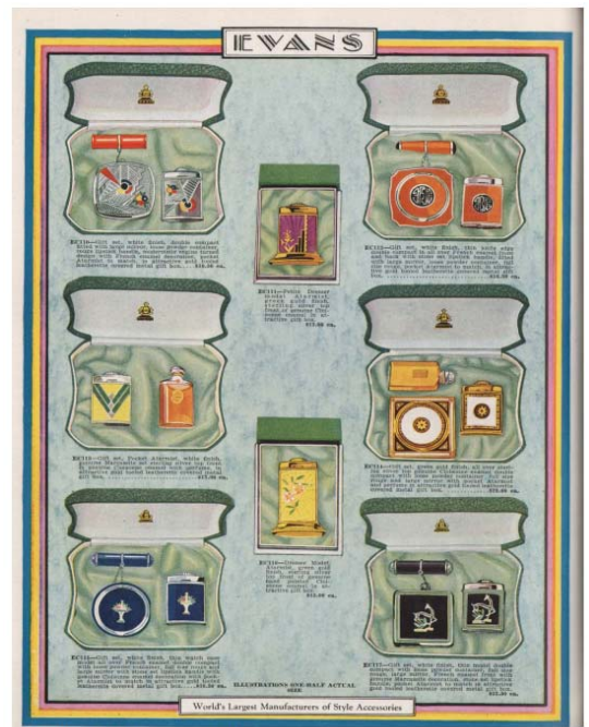
The Blue Book Jewelry Store 1931

The Evans Company produced wonderful compacts but also produced perfume sprayers. They called their smaller sprayers "Pocket Atarmist" and the larger was called the "Dresser Model Atarmist." The gift sets included the sprayer and a matching compact or perfume.