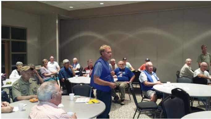
September 26 meeting