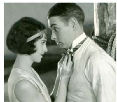
George K. Arthur and Louise Lorraine in Circus Rookies , MGM 1928.

http://www.mafca.com/downloads/Fashions/Articles/Perfect_Bow_2016-11.pdf