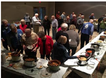
Soup Lunch on a cold day starts another year of Model A fun with friends!