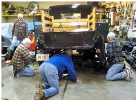
Disassembling differential to diagnose noise. Inspection revealed two broken ring gear teeth.