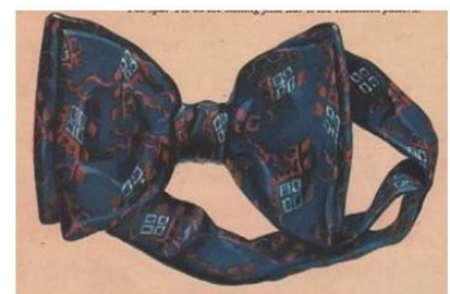
From a "Spur Tie" advertisement in The Saturday Evening Post 1928