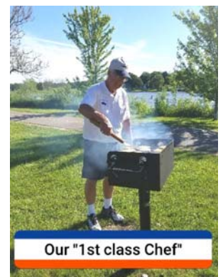
Our "1st class Chef"