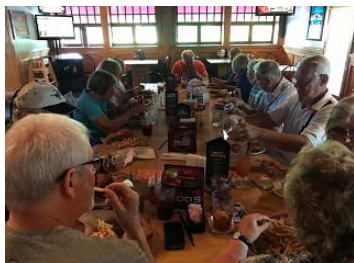
Club "meets" and dines at the Firehouse Restaurant in Roscoe.