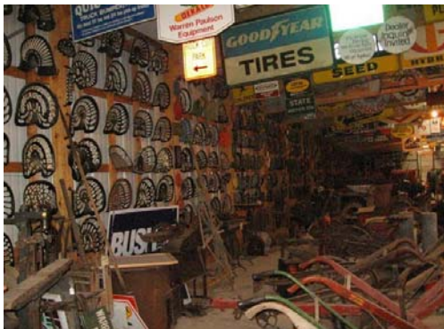
A portion of Warren Paulson's extensive collection of farm memorabilia