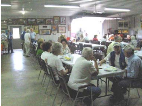
Lunch at the one of the Paulson's farm buildings