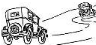
Let's Get Moving - Trip Ideas

Submit ideas to me by the 5 th of each month. Thank you!