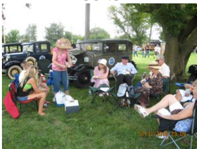
We enjoy a picnic lunch between train rides during the Vintage Transport Extravaganza at the Illinois Railway Museum.